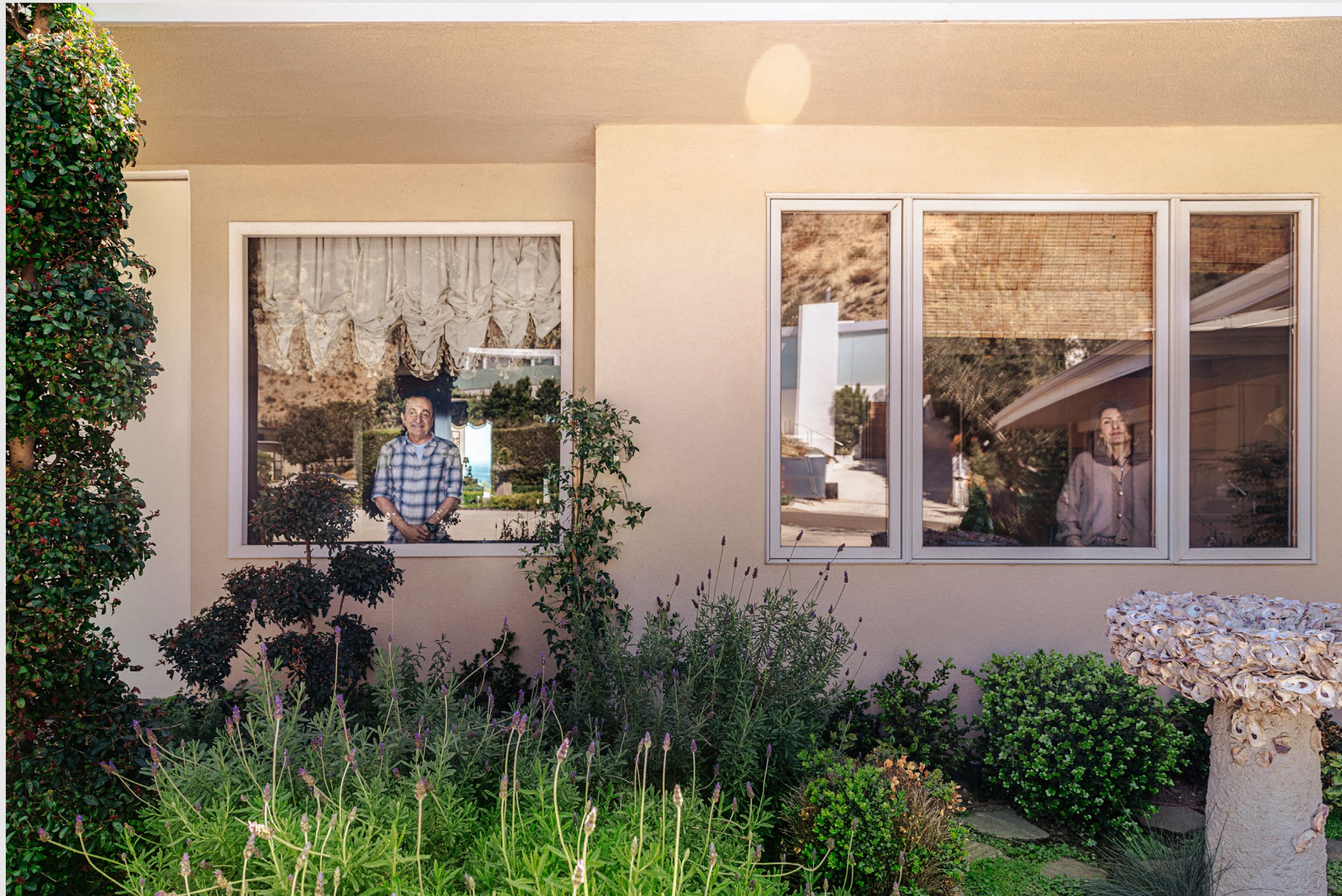
“Windows 20” – Fara