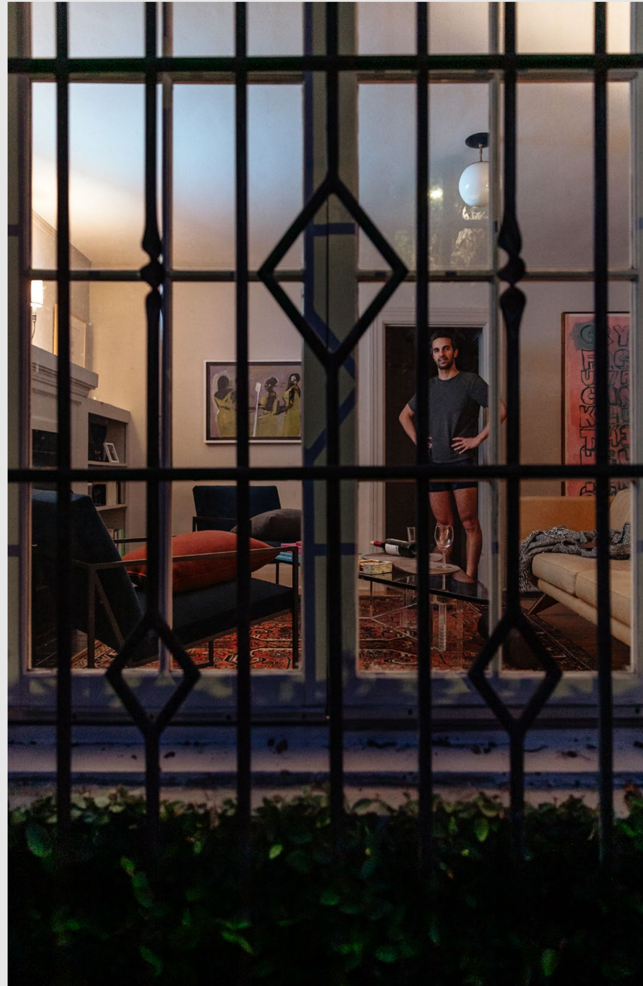
“The wine bottle was not staged.” – Dave